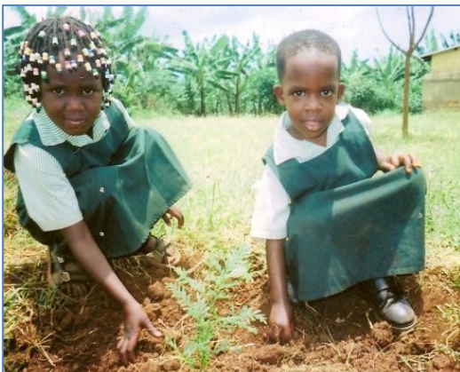
At St Josephs' Katembe Primary School each child identifies with a tree to takes care of. When leaving the school the child passes it on to a close friend in lower classes or a parent.

We hope to deliver prizes to both large and small networks...more details closer to the time.